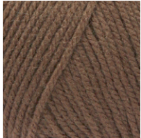
143 Dark Brown